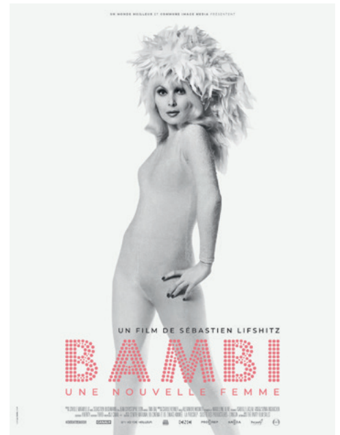
Original Theatrical Poster