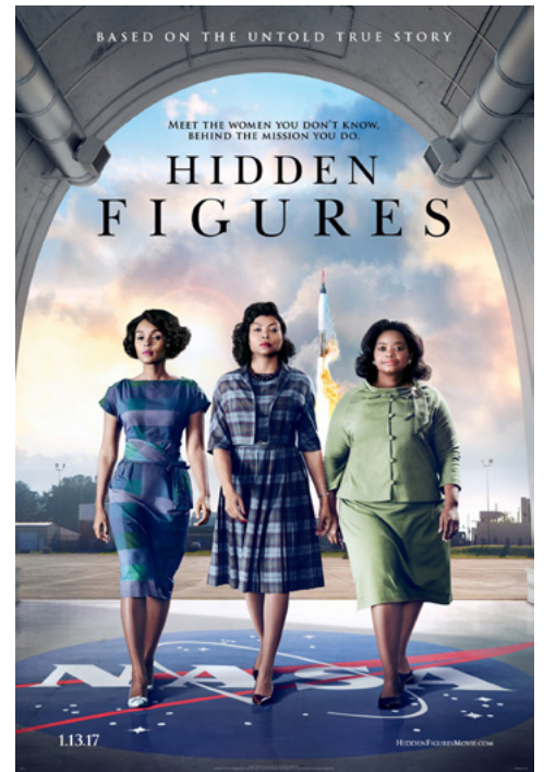
Original Theatrical Poster