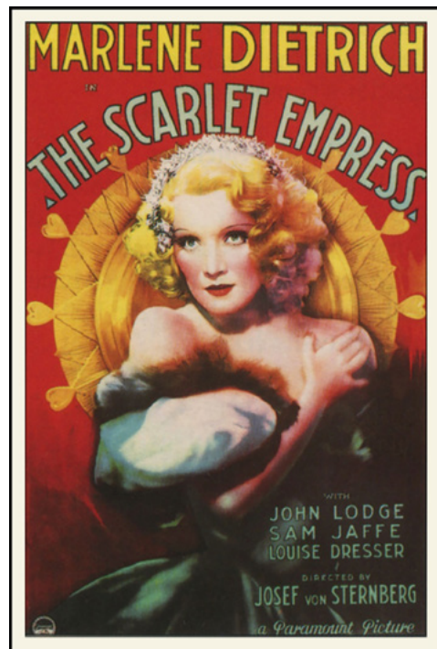
Original Theatrical Poster